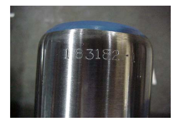
on top of the piston