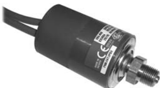
Optional Low Pressure Switch, N.O.: P/N 5253, N.O./N.C: P/N 5245