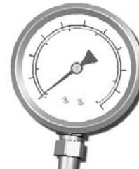
Optional 0-1000 psi liquid filled pressure gage, 1/8" Male NPT, P/N P10200